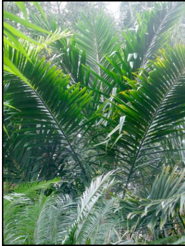
Five year old Syagrus amara growing in the Beck garden.