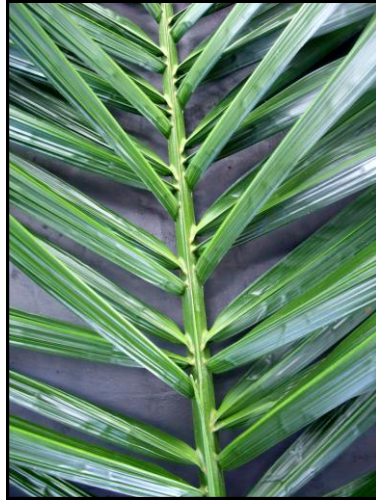
Syagrus amara leaf detail.