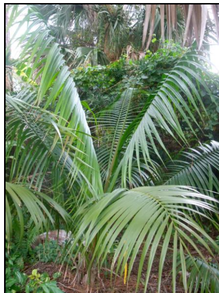
Heterospathe elmeri growing in the Beck garden.