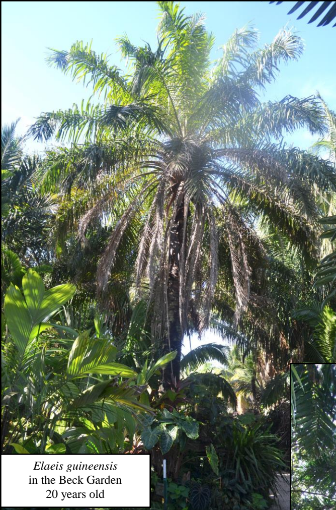
Elaeis guineensis in the Beck Garden 20 years old