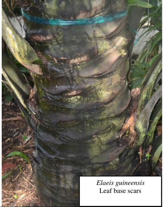
Elaeis guineensis Leaf base scars