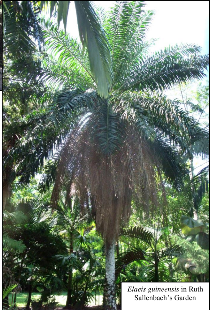
Elaeis guineensis in Ruth Sallenbach's Garden