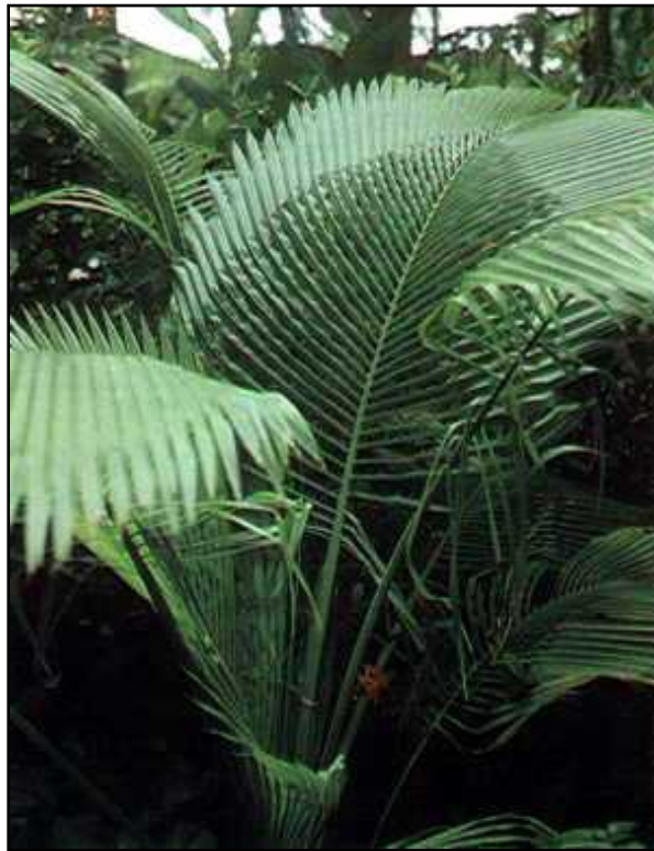
Juvenile Beccariophoenix madagascariensis displaying windows in the distal portion of leaf blade.