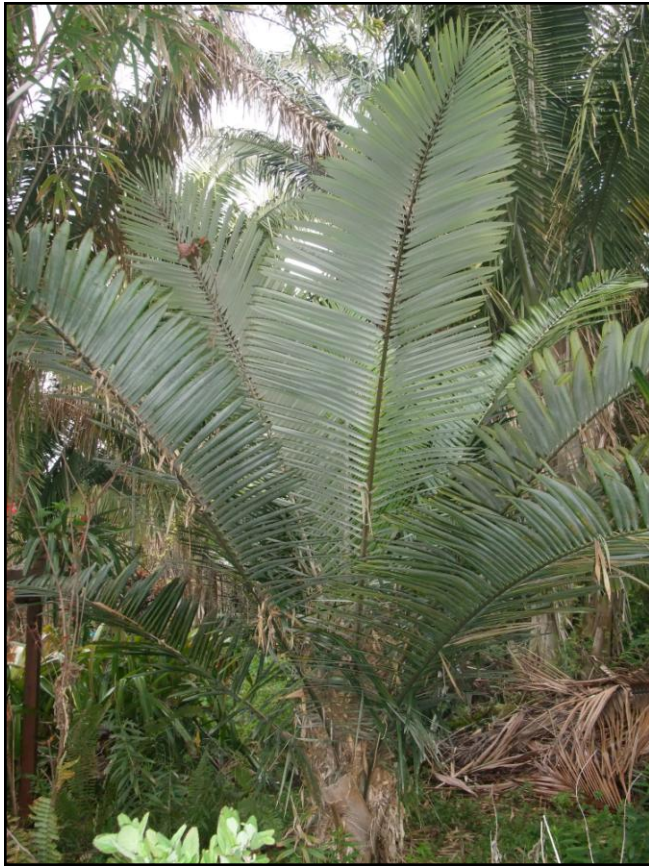
16 year-old Allagoptera caudescens planted in the Beck garden.