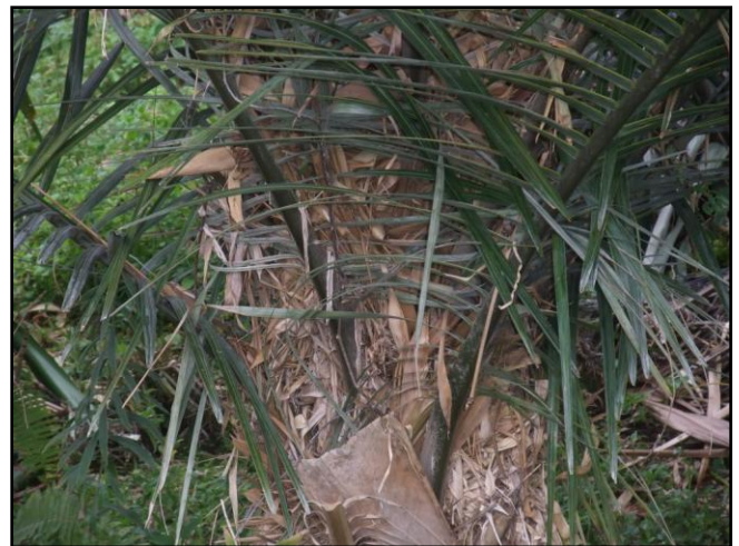
Leaf litter in Allagoptera caudescens crown