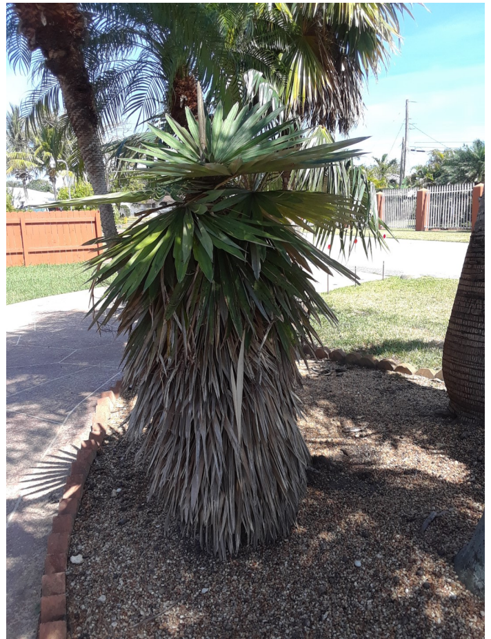
Coccothrinax borhidiana in the Rodriguez Garden Miami, Florida