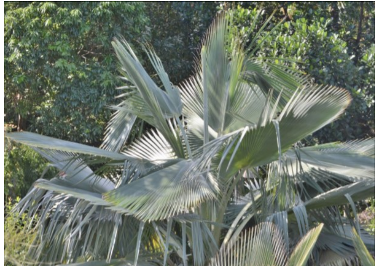
LEFT: Copernicia rigida growing at Fairchild Tropical Botanical Garden.