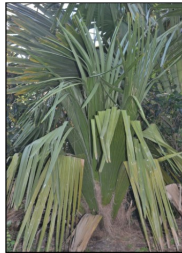
Twelve year old Copernicia rigida in the Beck Garden.