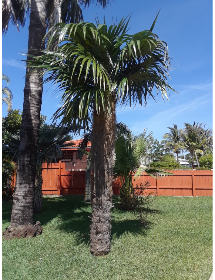
Coccothrinax crinita in the Rodriguez Garden Miami, Florida Photo by E.Rodriguez (2018)