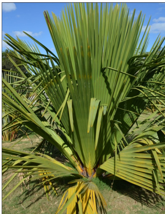
Copernicia rigida growing at Fairchild Tropical Botanical Garden.

Copernicia rigida is a palm native to central and eastern Cuba. It grows on savannas, open pinelands, and serpentine scrub. In habitat its stem can reach 45' in height and can measure 10-14" in diameter. It is similar in appearance to C. macroglossa but instead of semicircular leaves it grows narrow leaves which resemble slender cuts of pie. The leaves are so tightly whirled, the crown resembles a shuttlecock. The leaves remain in the upright position and become a litter trap. The Australian Palm Society states, "Some botanists are raising the possibility that C. rigida is carnivorous. Its leaves form a very effective trap for small animals, which die and rot there, providing nutrients for the plant."