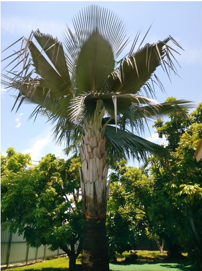
Copernicia fallaensis in the Rodriguez Garden Miami, Florida

I am very glad to be back in the community and doing something I love. Thank you to the Palm Beach Palm and Cycad Society for this opportunity!