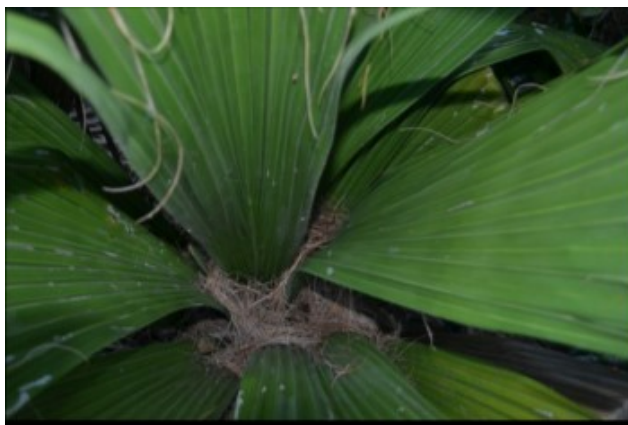
Copernicia rigida litter trap