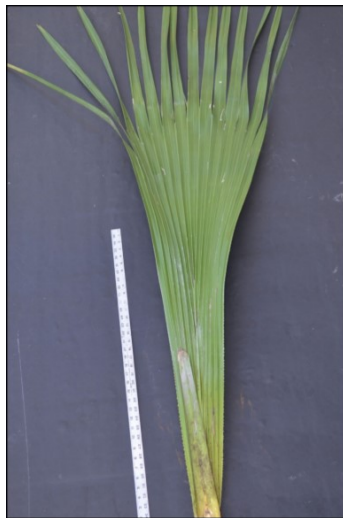
Copernicia rigida leaf detail (See yardstick on left)

C. rigida does hybridize in nature. There are two named, natural hybrids which occur in Cuba. Copernicia X sueroana is C. rigida crossed with C. hospita . Copernicia X vespertilionium is C. rigida crossed with C. gigas . Both of these hybrids are very attractive and they grow much faster than C. rigida . Both hybrids are large palms which rival C. baileyana in size. See the photos on page 6 of 12 year old hybrids growing in our garden.