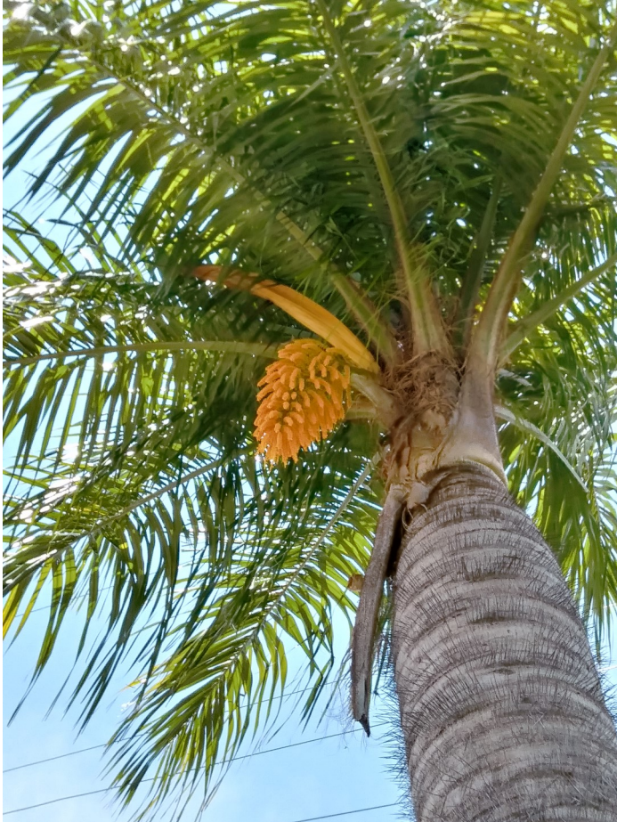
Acrocomia crispera flowering in the Rodriguez Garden Miami, Florida Photo by E.Rodriguez (2018)