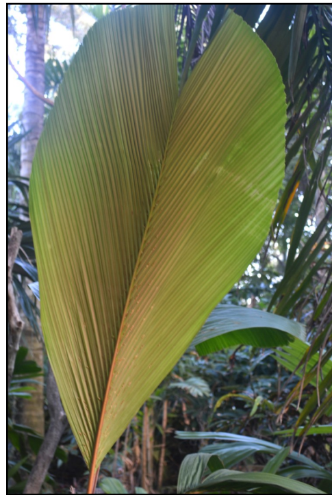
Verschaffeltia splendida Emergent frond In Beck Garden