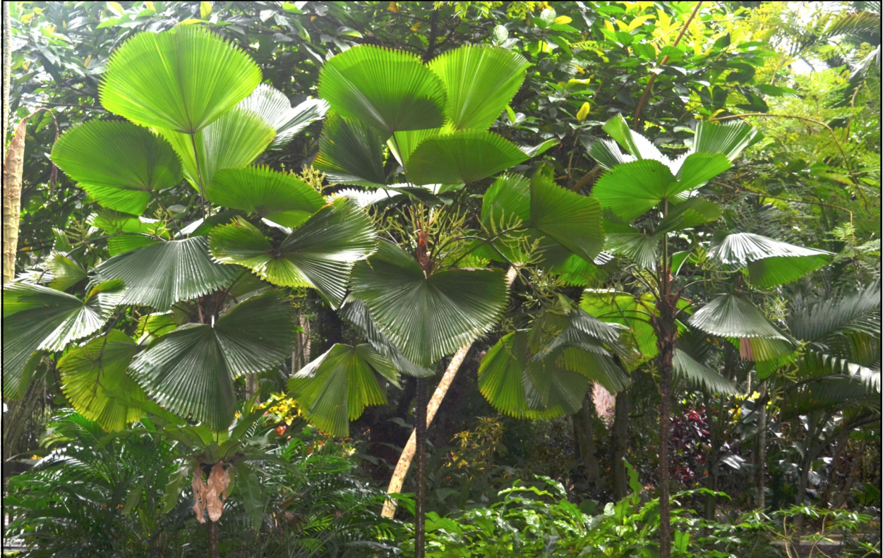
Licuala grandis at Flamingo Gardens, Davie FL