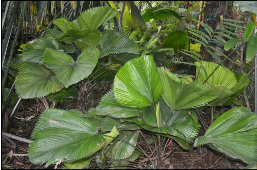
Licuala grandis in heavy shade at Beck Garden 20 years old (left), 7 years old (right)