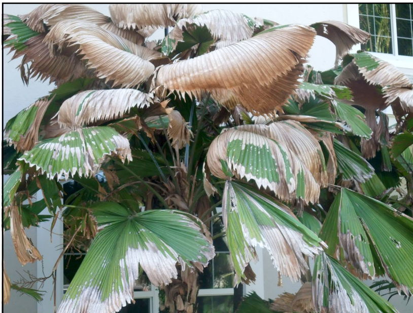
Licuala grandis showing effects of repeated low temperatures in 2010 in Coral Gables, FL