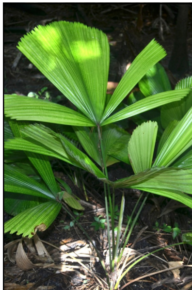
Licuala grandis at Beck Garden Split leaf form, 11 years old