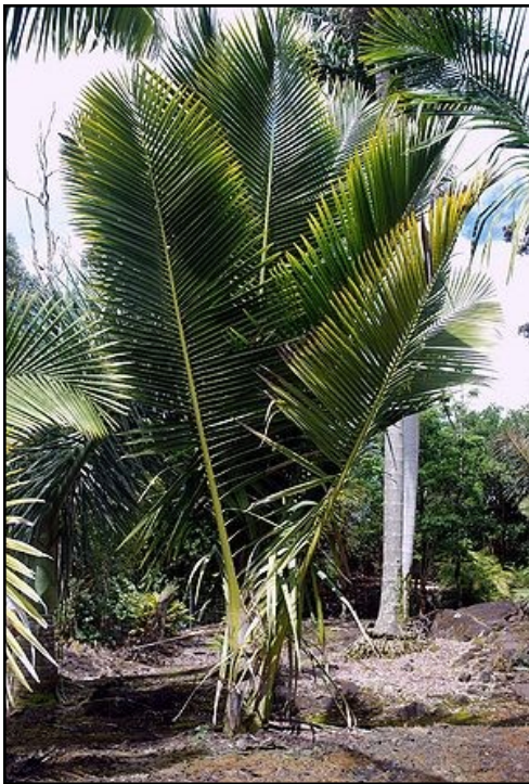
Ravenea dransfieldii at Floribunda Palms, Hawaii