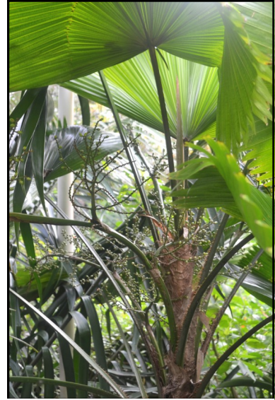
Licuala grandis inflorescence at Beck Garden (12 years old)