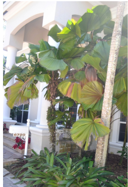
Same palm as shown on left fully recovered in 2016