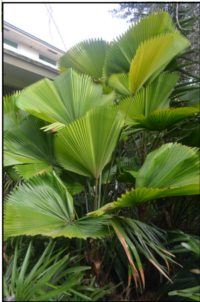
Licuala grandis in full sun at Beck Garden, 12 years old