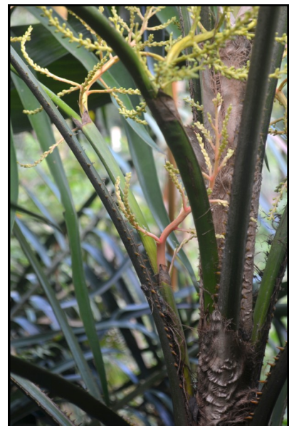
Licuala grandis with salmon colored peduncle at Beck Garden