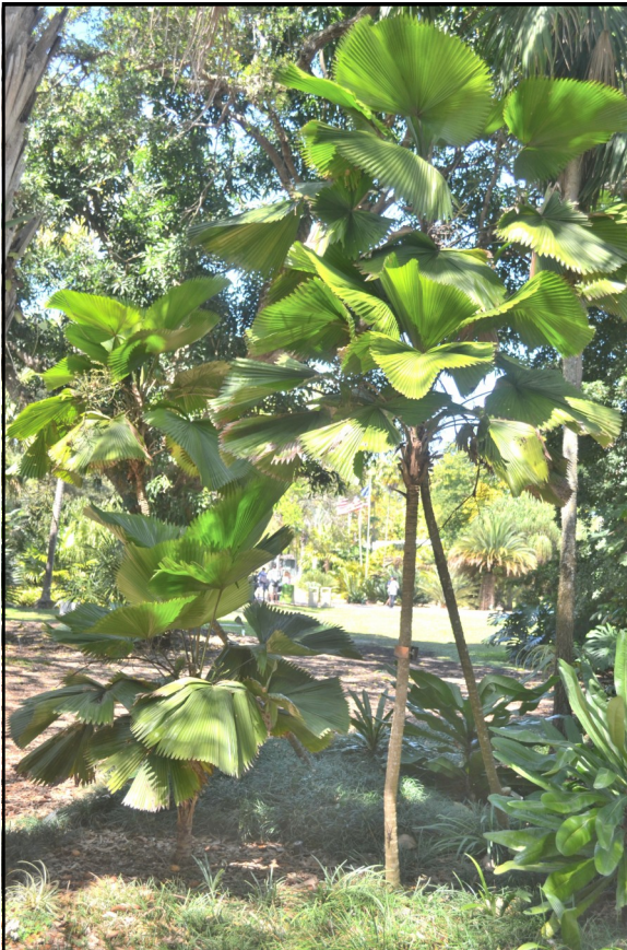
Licuala grandis at Fairchild Garden, Coral Gables, FL