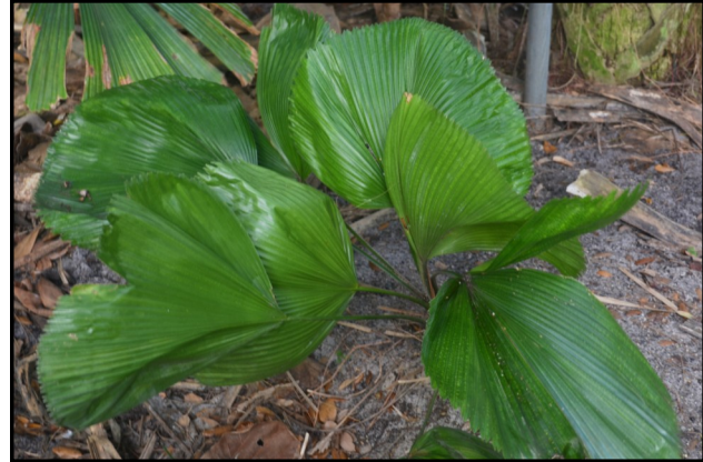
Licuala grandis grown on hardpan mound 2 years old at Beck Garden

I have a hard time identifying a more beautiful, tropical looking palm that grows so easily in