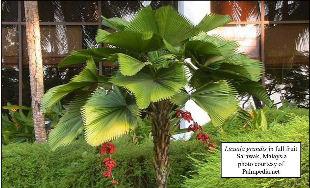
Licuala grandis in full fruit Sarawak, Malaysia