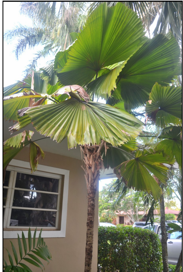
Licuala grandis at Page Garden, Palmetto Bay, FL