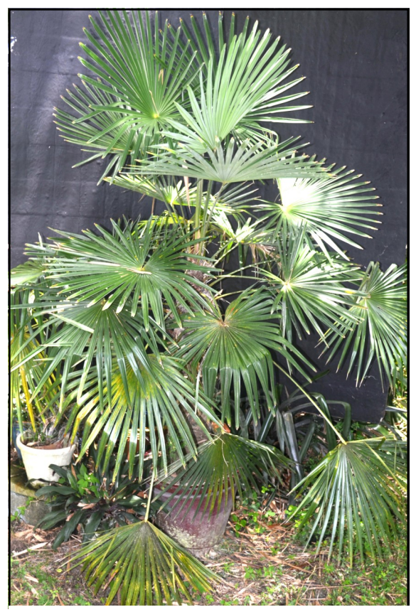
Trachycarpus fortunei 9 years from seed in Beck Garden