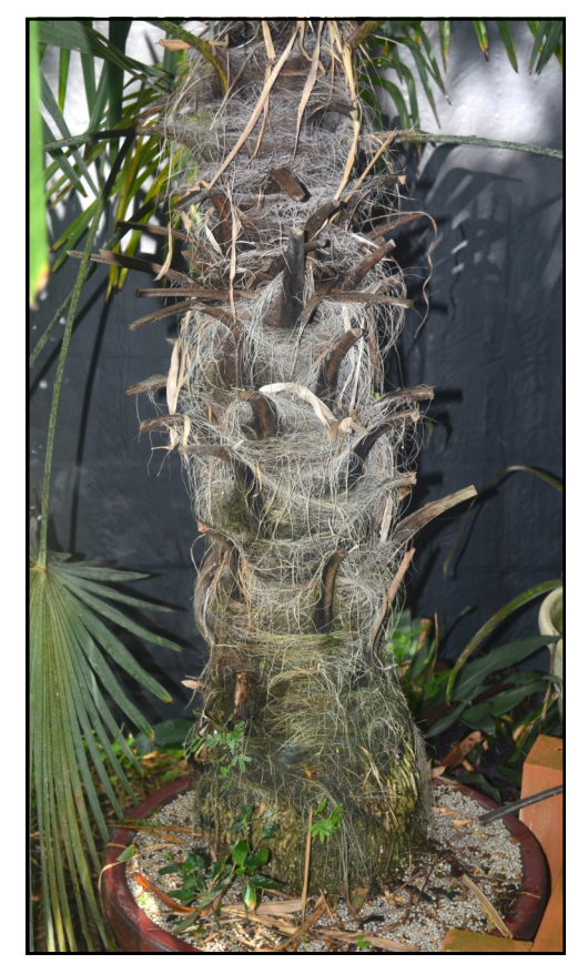
Trachycarpus fortunei 42" tall stem in Beck Garden