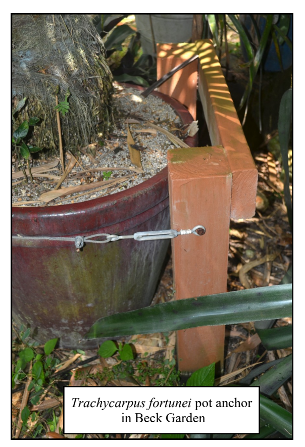
Random Beauty in the Beck Garden