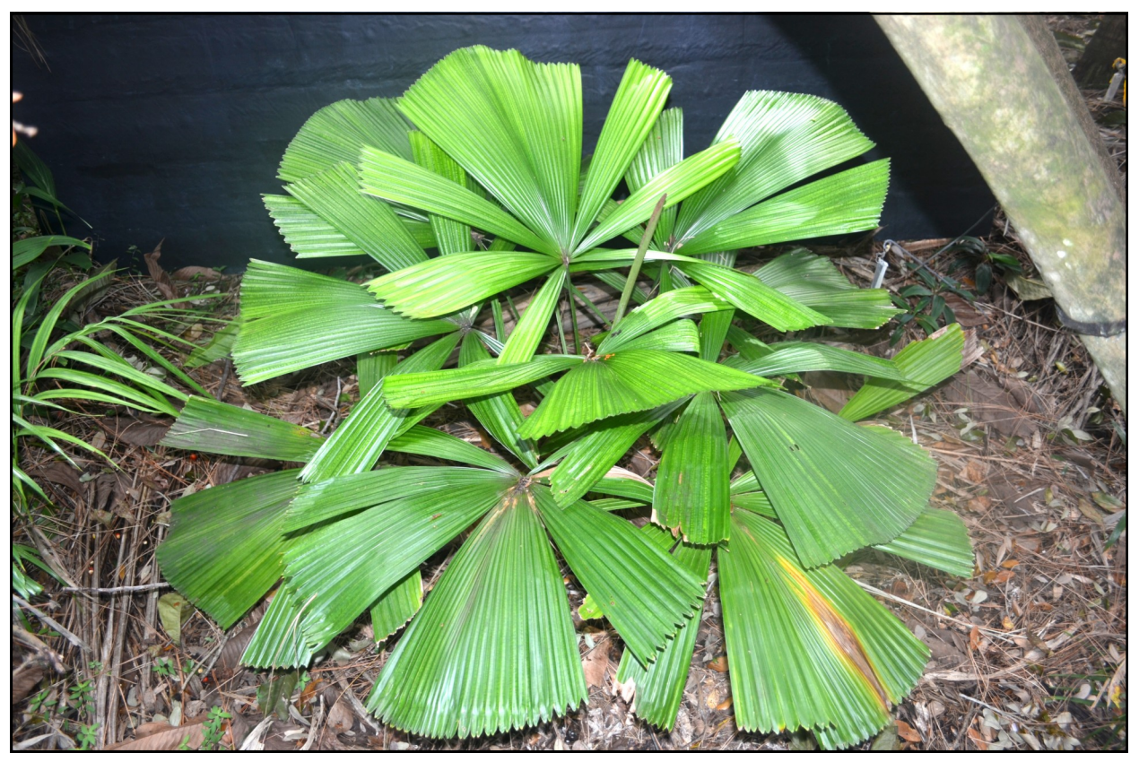
Licuala naumannii in the Beck garden