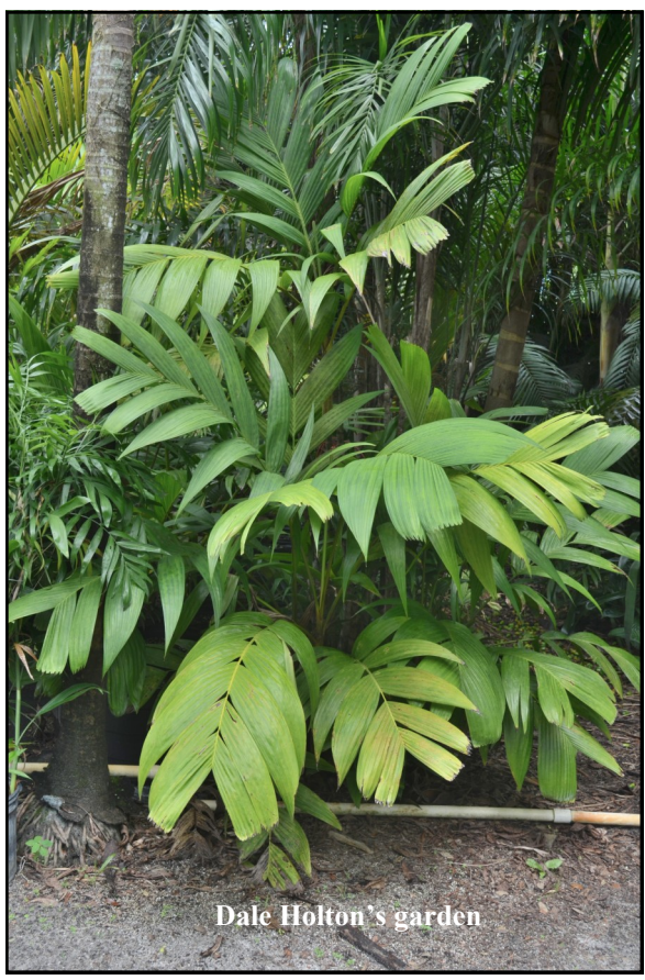
Pinanga coronata (blunt leaf form)

P. coronata is a proven winner in Palm Beach County. It is a small to medium sized, clumping, pinnate palm. It has widely spaced leaflets which emerge a pink or salmon color. Its salmon inflorescence is also quite attractive as well as its yellow crownshaft. The fruit change from red to black upon maturity. P. kuhlii has been lumped in with this species. If any stunted emerging fronds occurs an application of laundry borax will bring it back to health. This is not a chronic problem of this palm so recommended palm fertilizer is usually all that is required. I've never grown "blunt leaf" form in our garden. A few years back I saw one growing on Palm Beach Island and was impressed with its form.