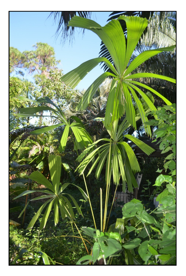
Licuala peltata var. peltata

This is a small palm with undivided palmate leaves. It is not as cold hardy as L. peltata but it is a more manageable size. We lost most of our L. grandis , planted in sand, after the 2009-2010 winter seasons. Some did survive but all seven palms planted in shell rock were unaffected by the record cold. This is a tip when growing L. grandis - plant in alkaline soil. Even planting next to your home foundation seems to improve growth of this species. I've never noticed any micro nutritional deficiencies in our garden