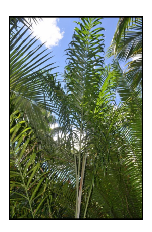
Dypsis madagascariensis var. mahajanga

D. madagascariensis var. mahajanga has been listed on Floribunda Palms price list for many years as a "landscape beauty." I wasn't familiar with this palm so I decided to plant it 2 years ago. In two years it has rapidly grown to an overall height of 14 feet. This variety is reported to be more cold hardy than the basic species. Its leaves also appear to be more plumose and the crownshaft is developing a waxy coating. It is a rapid grower which seems to appreciate our sandy soil. I have never noticed any nutritional deficiencies in this palm's short life. I grow mine in full sun. I expect this palm to grow to a medium size similar to a Veitchia or Archontophoenix.